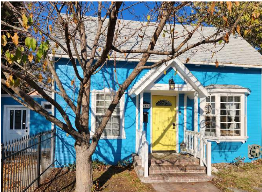
SMURF HOUSE AND STUDIO APARTMENT