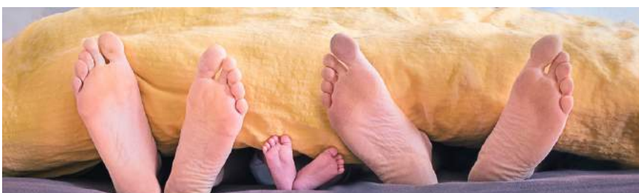
PG 2 | NEED EXTRA PILLOWS/BLANKETS/TOWELS??